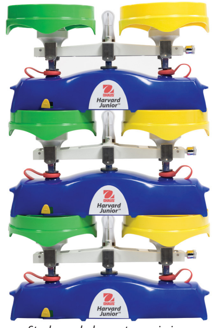
Stack your balances to maximize storage space when not in use!