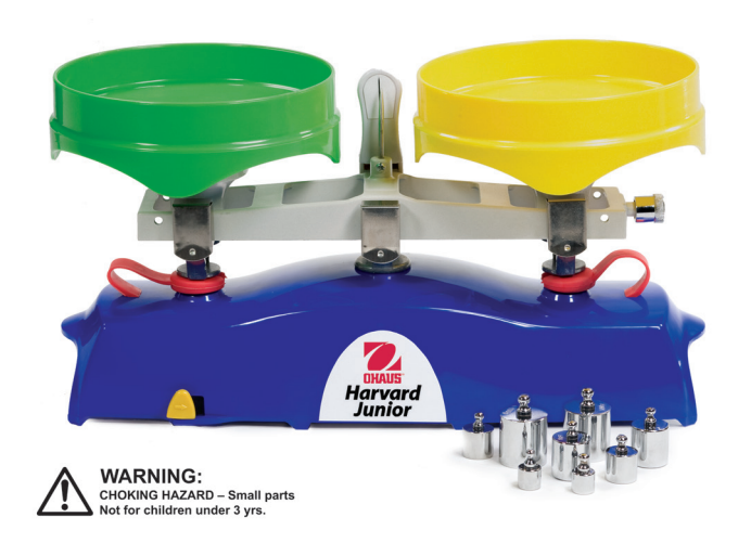
Includes an 8-piece, metal mass set