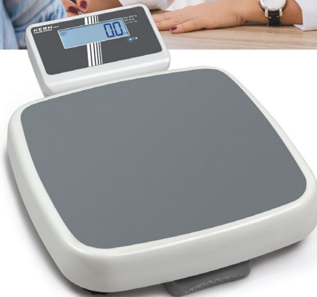
KERN MPD 250K100M