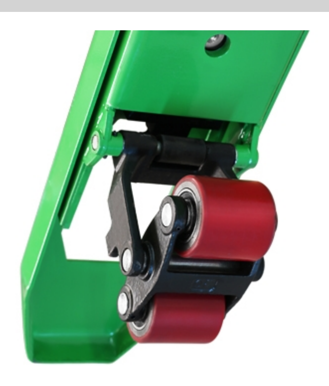
Closed Forks underside, for a higher protection against dirt.