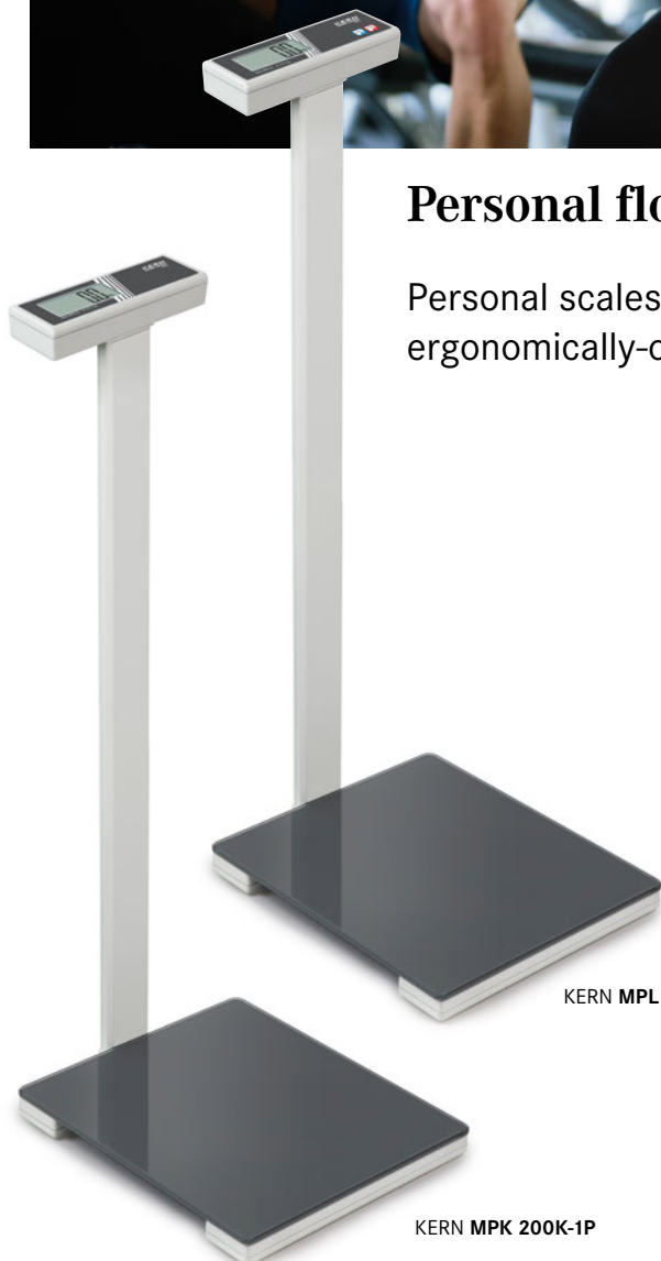
KERN MPL 200K-1P

Personal scales with column for convenient, ergonomically-optimised operation